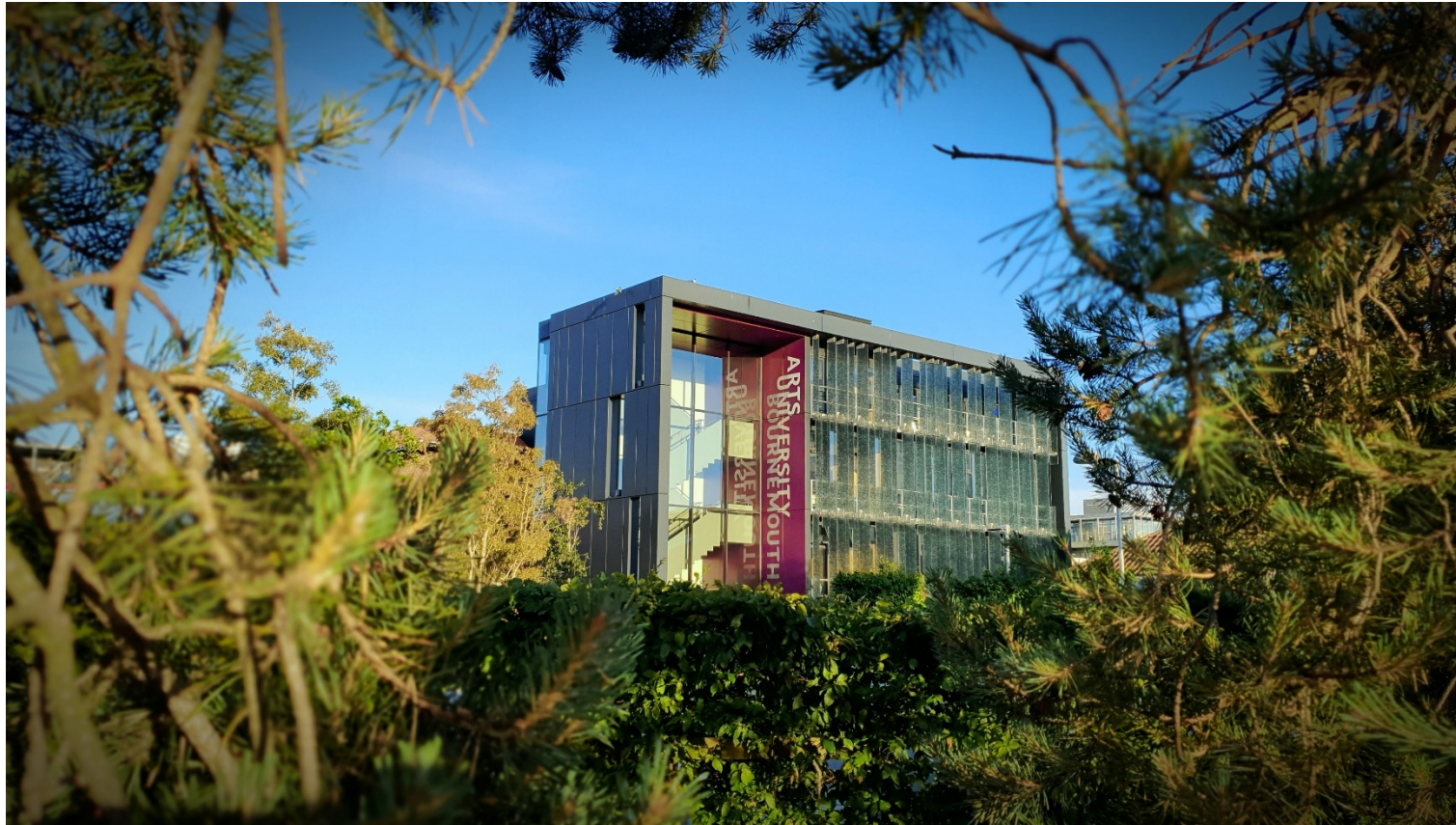
ARTS UNIVERSITY BOURNEMOUTH

If you have any questions about accommodation, funding or student support please contact studentadvice@aub.ac.uk