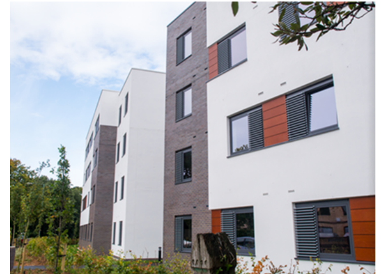
ARTS UNIVERSITY BOURNEMOUTH