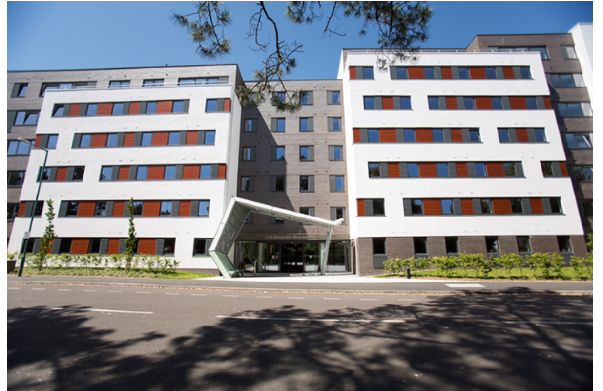
ARTS UNIVERSITY BOURNEMOUTH