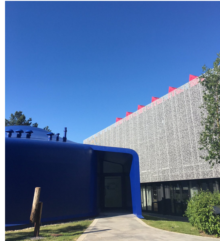
ARTS UNIVERSITY BOURNEMOUTH