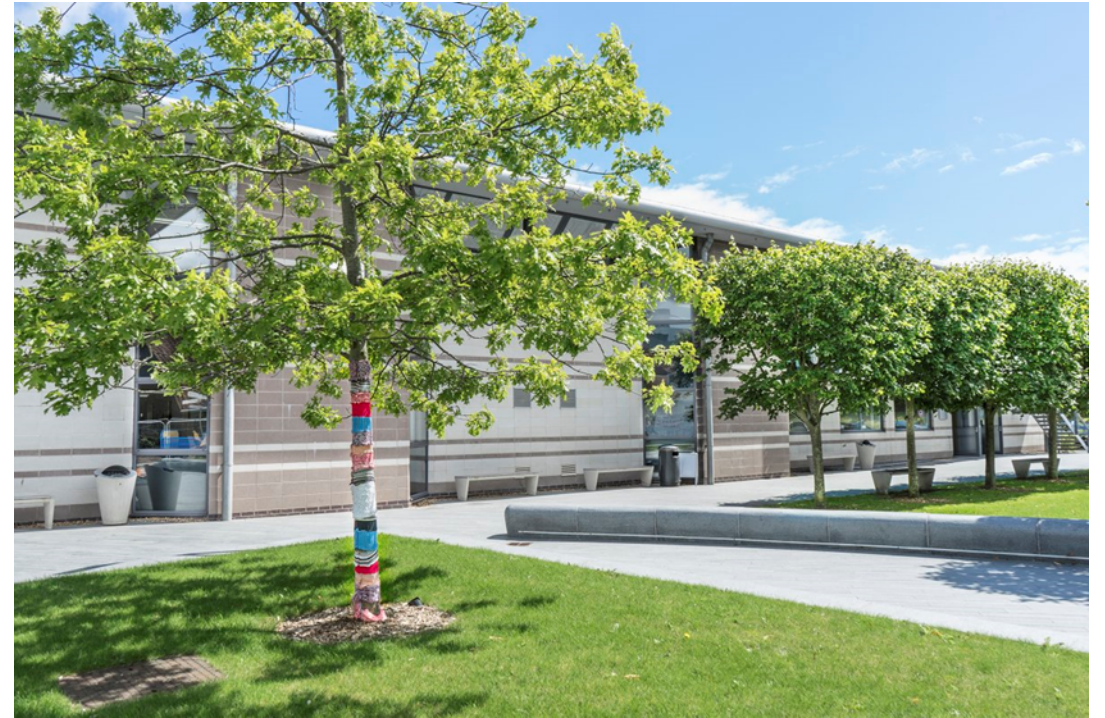
ARTS UNIVERSITY BOURNEMOUTH